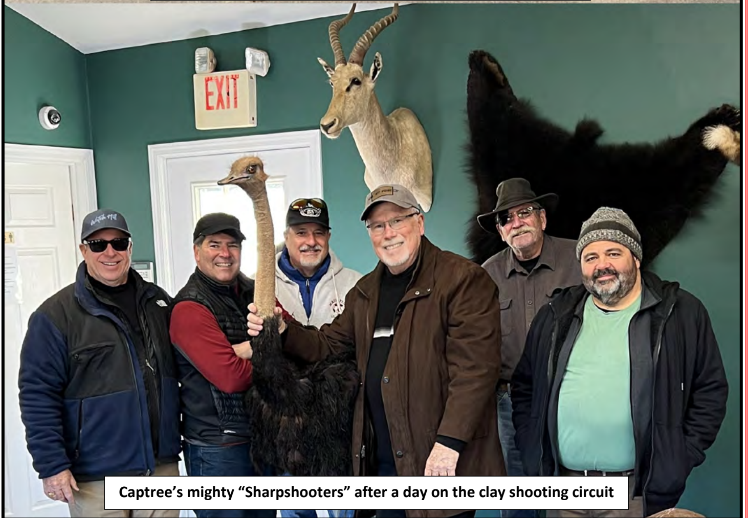
Captree's mighty "Sharpshooters" after a day on the clay shooting circuit