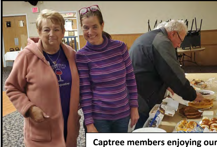
Captree members enjoying our "Just Desserts" theme for our November General Membership meeting.