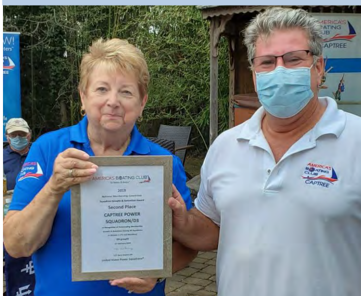
National Membership Committee award to Captree —2nd place for outstanding Membership Growth and Retention.